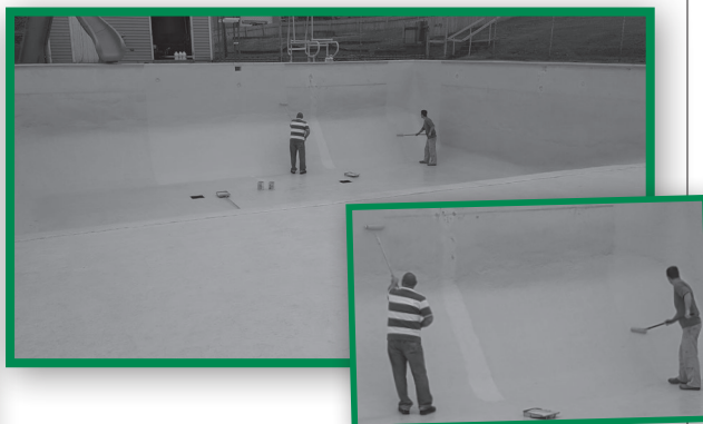
Painting the Pool