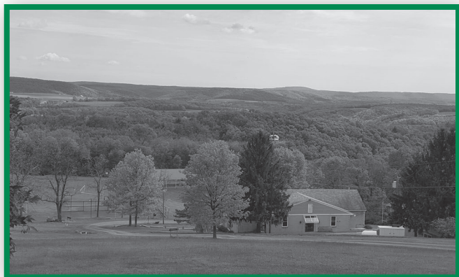
Spraying Camp for Gypsy Moths