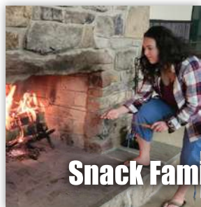
Snack Family Weekend