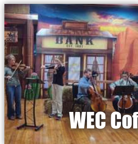
WEC Coffee House